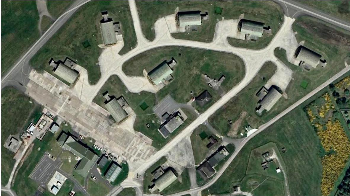
Figure 1: RAF Squadron Buildings with Hardened Aircraft Shelters