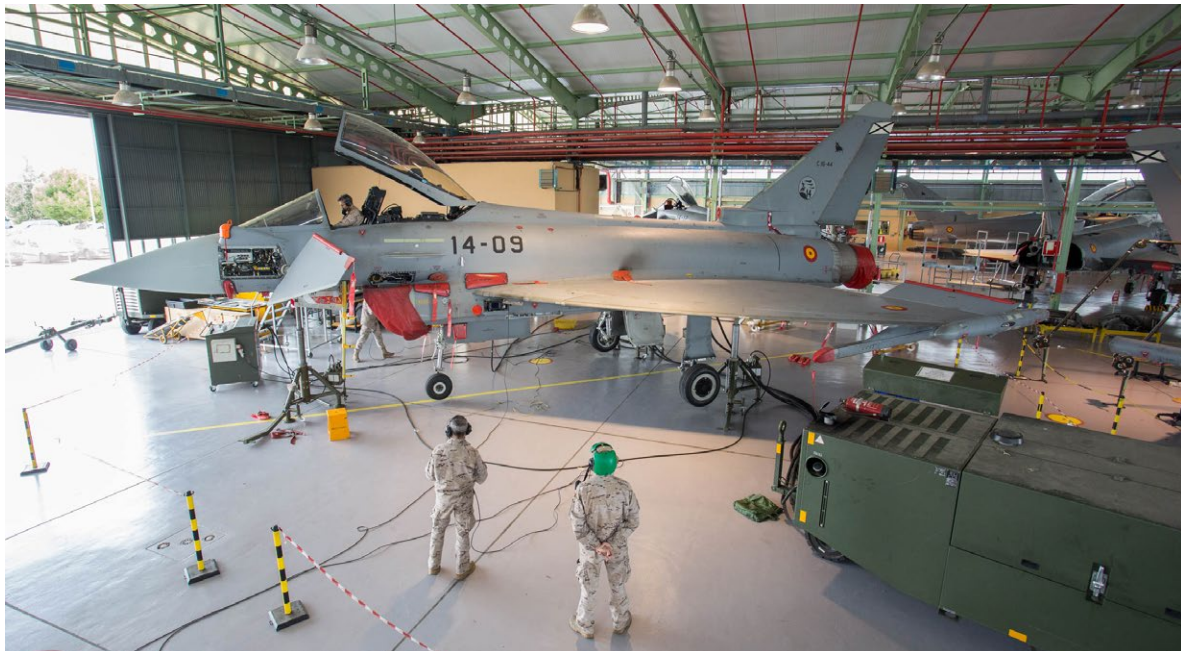
Figure 4: Spanish Air Force Maintenance Personnel Working on a Spanish Eurofighter at Albacete Air Force Base, Spain, 2015