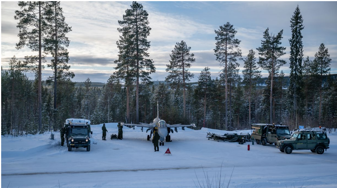
Figure 3: Swedish Conscript Mechanics Rearm a JAS-39C Gripen Between Sorties at a Remote Dispersal Airstrip, 1 February 2023